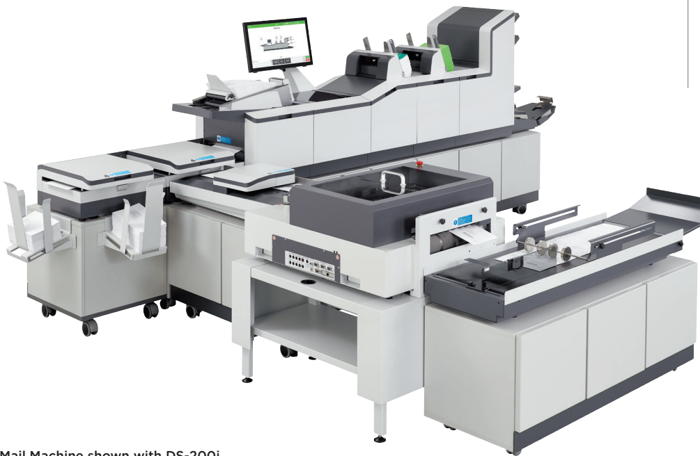
Mail Machine shown with DS-200i